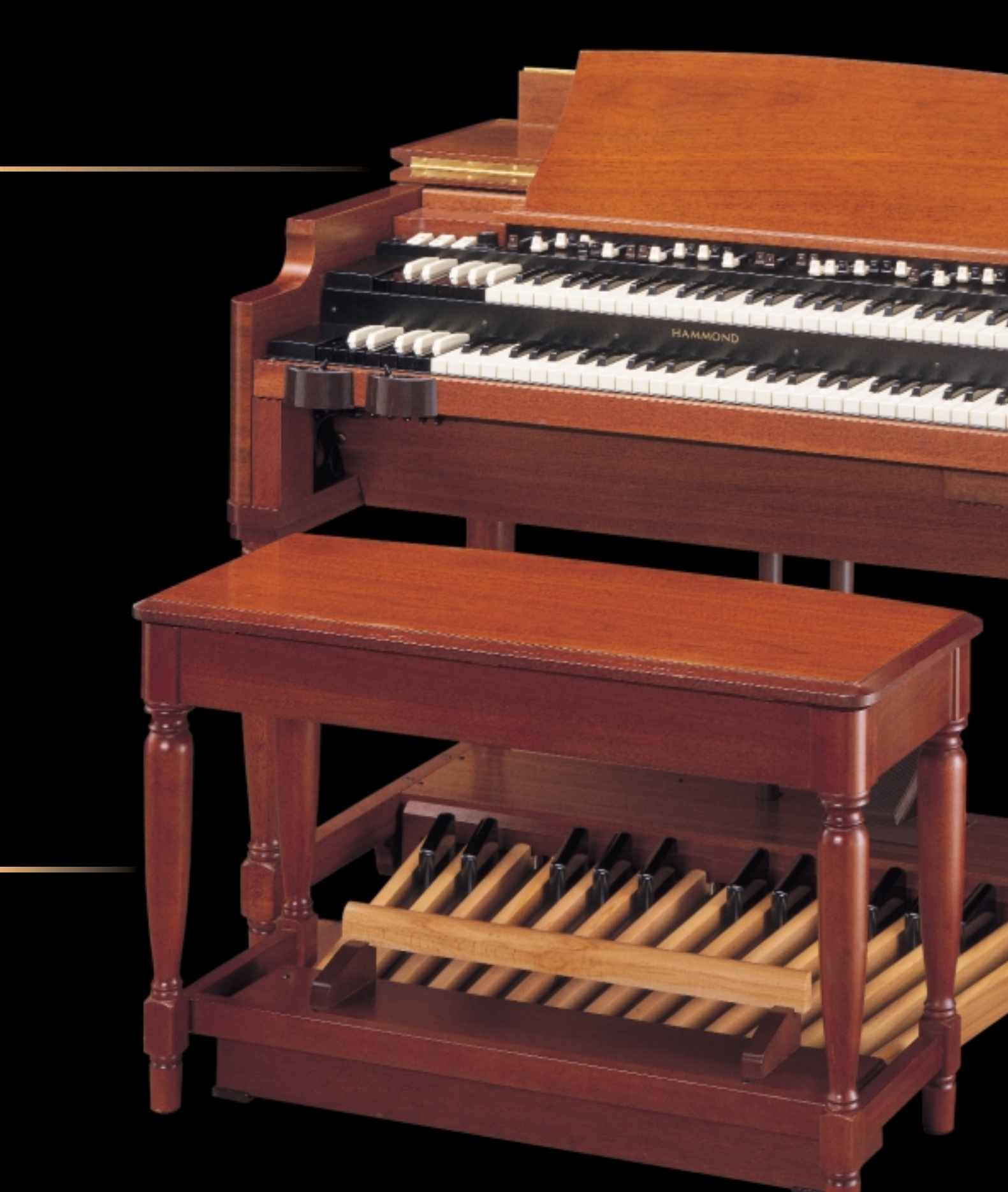
birth of the New B-3... PURE Hammond The birth of the New B-3... PURE Hammond The birth of the New B-3... PURE Ham