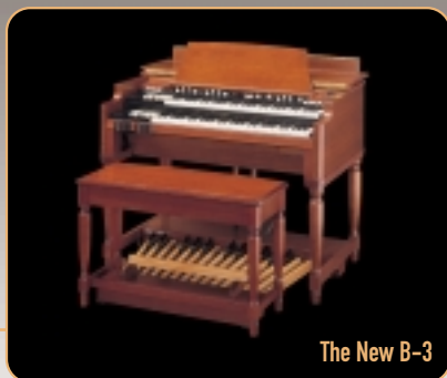
The New B-3