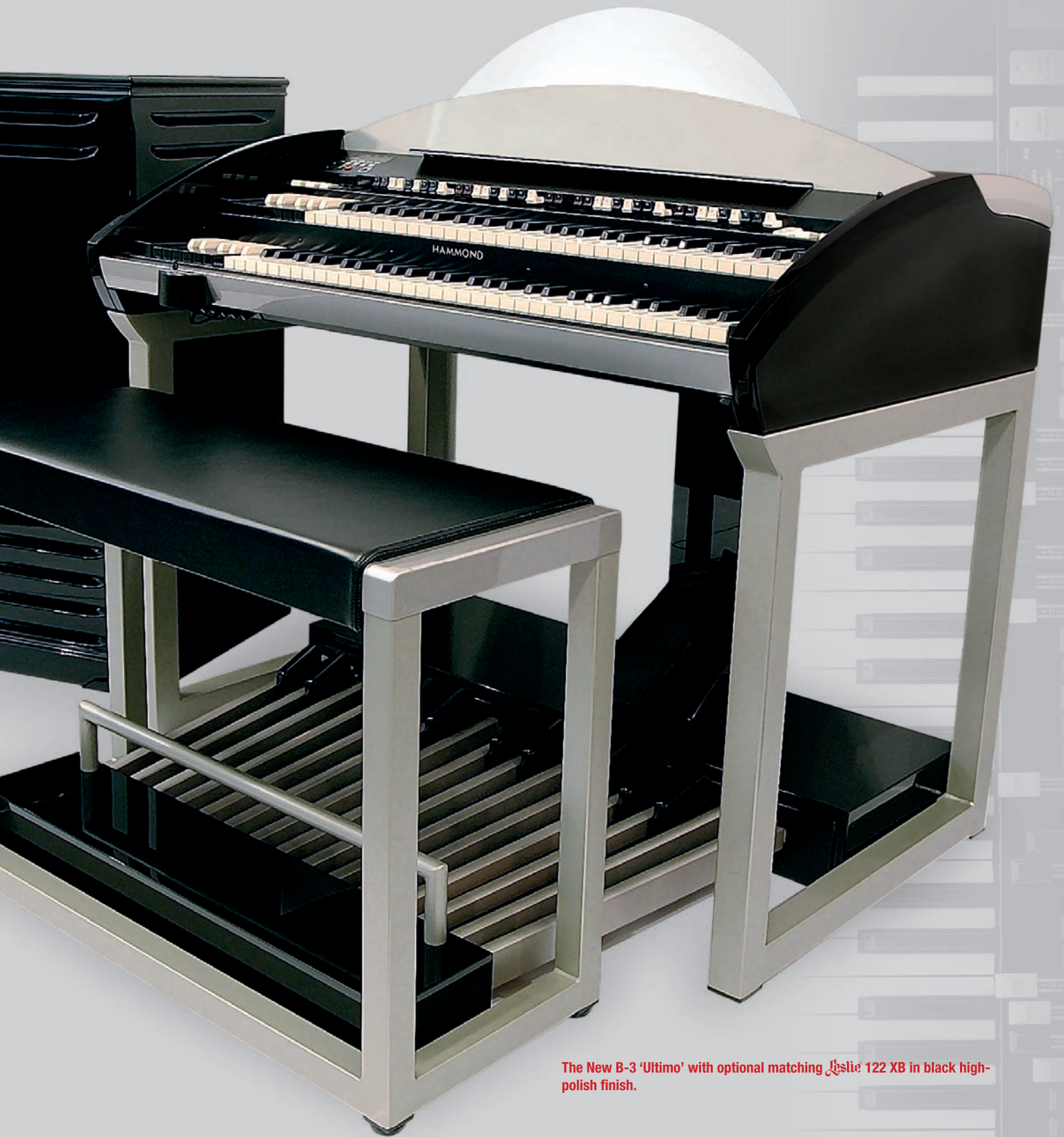
The New B-3 'Ultimo' with optional matching Leslie 122 XB in black high-polish finish.