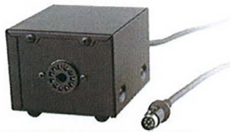
■ XLD-811 Leslie Adapter Mini 8 pin to 11 pin