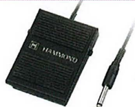
■ FS-9H Foot Switch